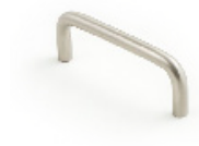
Satin Stainless Steel